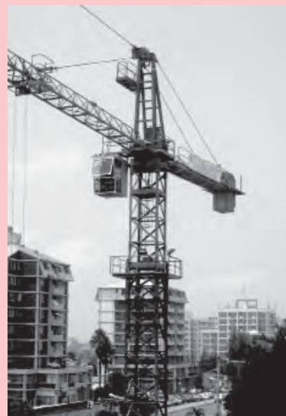
Construction site in Addis Ababa

? Do you think Samuel deserves to be a wealthy man? Discuss.