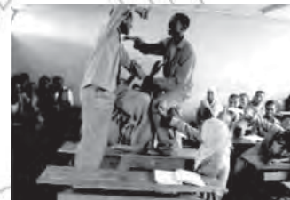
Misuse of classroom furniture

Look around your school and try to find examples of bad treatment of school property. What would be the consequences of improper use of school property like furniture. Suggest what needs to be done to look after this properly.