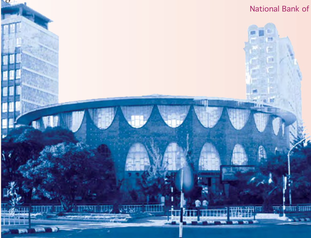
National Bank of Ethiopia