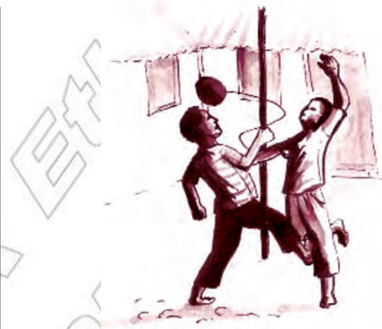
Boys playing tezer

Saving means keeping something for the future. One of the reasons that people save is for the future. For example, most people save to buy or build a house, or buy a car. These are big items which require a lot of money. If you start saving