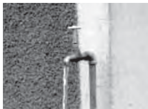
Misuse of our water resource

As pointed out earlier, planning helps you to use your resources well so that you can benefit from them. This also works for the things which you have to do at home, in school and in the office. This saves a lot of money and time. The purpose of learning to plan and to save is to develop the habit of living within the limits of your income. By matching your life style to what you earn, you avoid wasting your resources and those of your family. Similarly, you should respect public property like public phones, waste baskets, school desks etc.